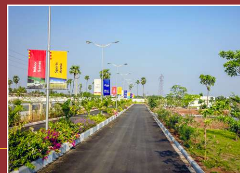
Actual site photos

Distances indicated are approximate. This ad is conceptual and not a legal offering for Sale / Agreement.